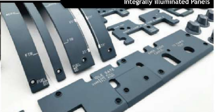
Integrally illuminated Panels