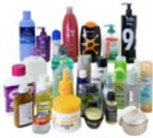
COSMETICS & BODYCARE