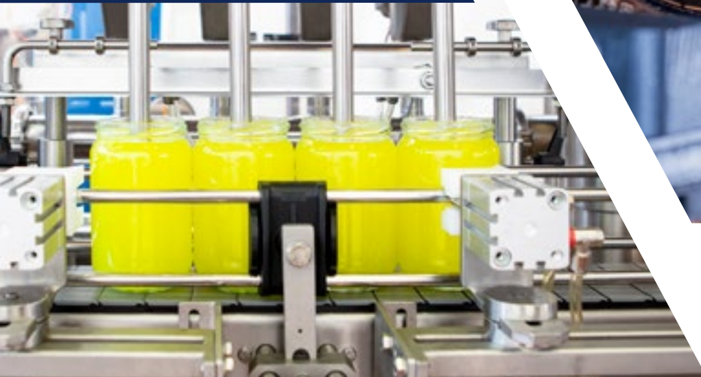
LINEAR FILLER FOR DENSE AND SEMI DENSE PRODUCTS