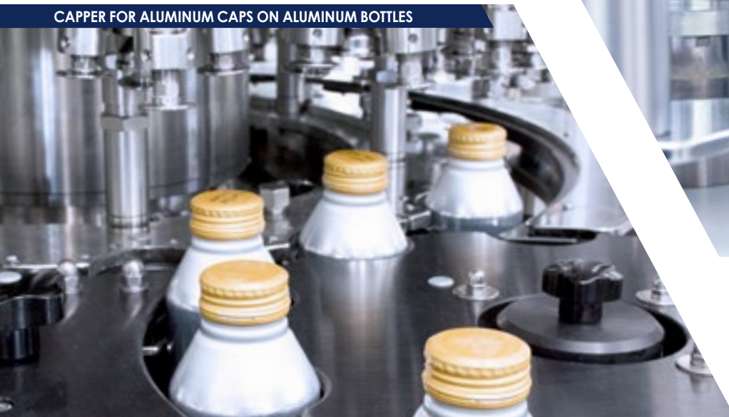
CAPPER FOR ALUMINUM CAPS ON ALUMINUM BOTTLES