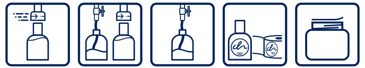
FILLING MACHINE FOR BODY CREAM

Founded in 1957, TIRELLI is focused in designing "turn-key" equipment, mainly for the cosmetic, bodycare and homecare industry. For speed up to 9.000 CPH, the Tirelli solutions bring a remarkable robustness together with a unique flexibility of use and of format change.