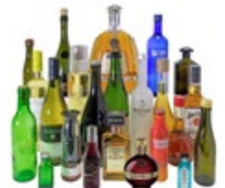
WINE & SPIRITS