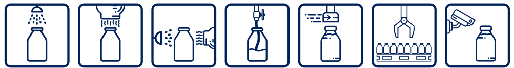
LINEAR CAPPING MACHINE FOR TWIST-OFF CAPS ON GLASS CONTAINER

Founded in 2008 by merging UNIMAC, specialized since 1991 in palletizing and basket loading/unloading solutions for the food and chemical industries and GHERRI, focused since 1936 in the agro-food sector. UNIMAC-GHERRI today designs and manufactures filling and capping of glass containers with twist-off caps for liquid, semiliquid and pasty products, in addition to its well-known pal/depal and loading/unloading systems, till to turn-key packaging lines for food.