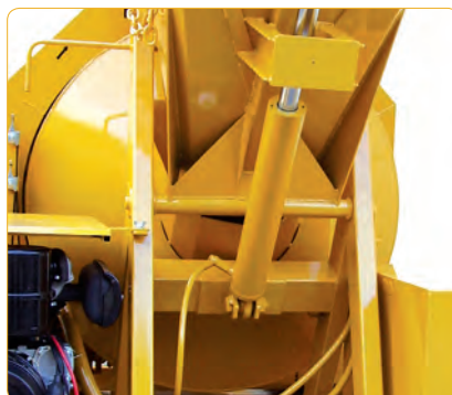
*Loading cell weighing system