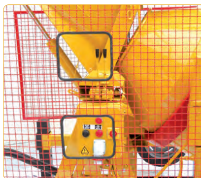
version with scraper blade

*Machine output varies according to type of material and drum inclination