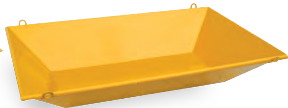
**Chute on 4 sides